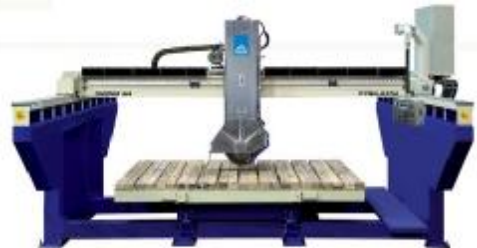
Table Turn / Tilt—Powered tilting 85° & Power rotating 0° - 360° Hydraulic